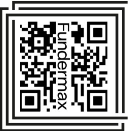
Order Interior Samples