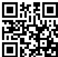
Interior 2.3 | Essential

Industriestrasse 38 CH-5314 Kleindöttingen T +41 (0)56 268 83 11 infoswiss@fundermax.biz www.fundermax.com